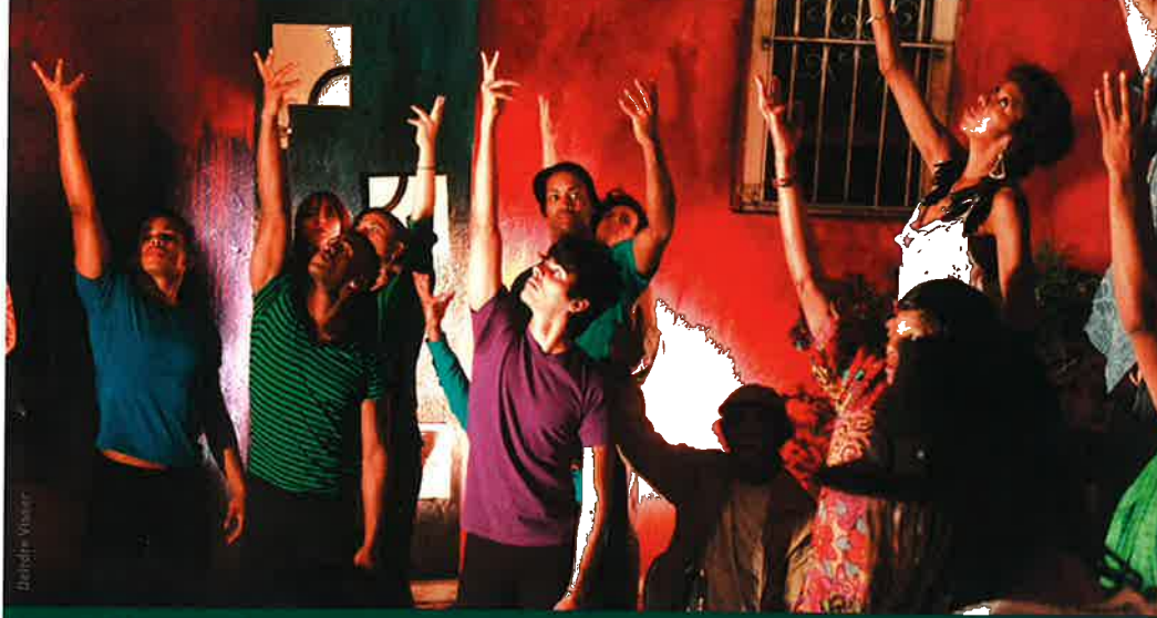
(Above) Tenderloin resident co-creators perform alongside local dancers.

To date, 40 community members and 14 professional artists